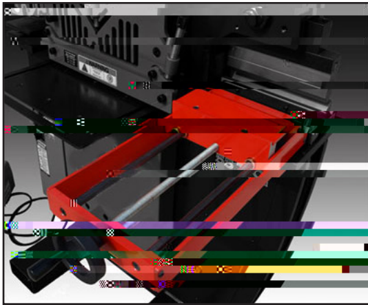
Press Brake Back Gauge